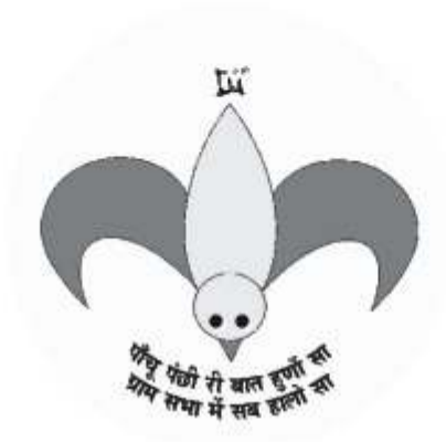
Paanchu Panchi: Promoting citizen participation in public decision making at the village level.

This year, we have also been working on an integrated communication package for mobilising citizen participation in the Ward Sabhas and Gram Sabhas in Rajasthan and Gu-