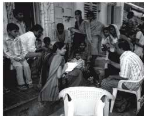
Active citizen engagement forms the basis of participatory governance processes: Such community meetings (Veraval) help identify the interests of the poor and provide them space for collectively making social choices.

In Gujarat, we prepared a detailed paper mapping the access and highlighting the issues of the poor in Veraval. The paper illustrates the process of consultative information collection and facilitates the process of interest articulation of the vulnerable sections in the city- such as the fisherfolk, fish hawkers and labour employed in the processing and transportation industries in the town. We have also helped the municipalities of Idar, Modasa and Bavla prepare Solid Waste Management plans. The plans have been prepared based on extensive consultation with the citizen groups, elected representatives, safai kaamdars , informal workers working with the sorting and recycling of waste etc. All three municipalities are in the process of machinery procurement; while Modasa has submitted the proposal to Gujarat Urban Development Corporation Ltd. for assistance for implementation.