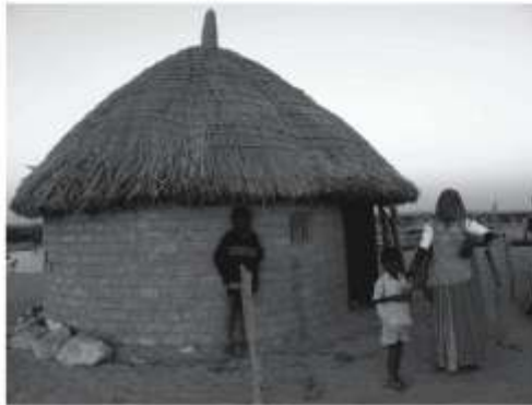
202 jhompas were constructed in eleven villages of Barmer

In response to the unexpected floods in Barmer, UNNATI helped provide relief and interim shelter support to 350 households. Based on our prior experiences we recognised the need for co-ordinated response in distribution of relief material and its availability to the worst affected. We helped channelise cash and material to more than six hundred families from various supportive agencies. The work was implemented with the support of local NGOs working in the district.