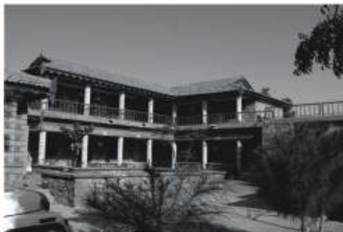
Regional Resource Centre, Bhachau

We maintain our focus on reflective learning and peer sharing in the programme on Disaster Risk Management. Based on our experiences and learning, we hope to prepare relevant