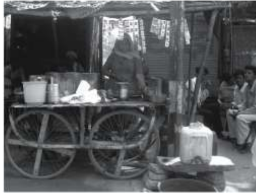
The City Essentials: A typical informal economy worker lives and works from the margins- both spatially and figuratively.

We have also linked up with the Society for Promotion of Area Resource Centre, Mumbai and the Government of Rajasthan to help construct community sanitation blocks in select non-notified slum settlements of Jodhpur on a pilot basis. All resource costs will be borne by the concerned local bodies. UNNATI will extend support in developing and documenting appropriate institutional mechanisms to facilitate the subsequent scaling of the design and construction activity.