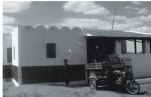
Community Based Disaster Preparedness: Rescue Shelter at Lakhara, Kutch.

During the year, we facilitated the preparation of Disaster Preparedness Plans in ten villages of Kutch district, with the specific objective of reducing their vulnerability to various forms of disasters. We encourage the communities to identify the incidence and frequency of disaster and promote community responses to deal with them. Such a reflective process, tapping into the vernacular knowledge base of the communities encourages them to develop collective responses and reduces their dependence on external support. This directly affects the total costs of relief and rehabilitation favourably. Of these Preparedness Plans in ten villages, rescue shelters with normative minimum level of services have been developed in five villages. In one village a check dam has been constructed. Work on retro fitting of houses for ensuring shelter safety has been done in four villages; where cyclone hooks have also been installed. In addition, seventy seven houses have been upgraded during the year for disaster safety.