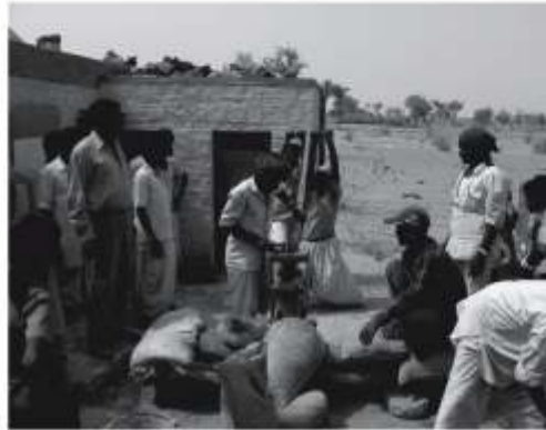
Artisans are trained to construct using low-cost, environmentally sound and sustainable construction material and organised into guilds to augment their livelihood opportunities.

We have also been successful in linking the construction activity with the livelihood security for the people. Towards this end, four artisan guilds have been trained and are being supported to undertake construction using such alternate technology and material.