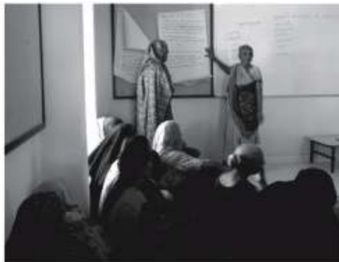
Building knowledge : Participatory reflection for planning for future action

role of Social Justice Committees in the three-tiered Panchayati Raj structure. Saachu Swaraj depicts the effect of transparency, responsibility and leadership in good governance. To promote civic education on financial reforms and building the capacity of Panchayats to undertake developmental works, a film titled 'Mane Nani aavakna Jharna Bane Moti Sarita' was prepared. On