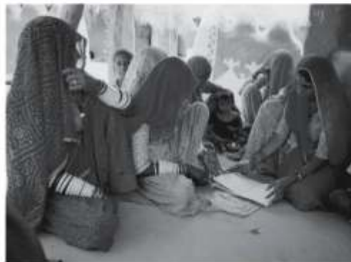
Separate meetings are conducted at the village level for women: this works to provide women with an appropriate public platform to articulate concerns and work collectively

UNNATI has been working to mainstream gender issues, both within the organisation and its partners and with the target groups through its programmatic activities. This year, we facilitated a Gender Audit of the mandated organisation-