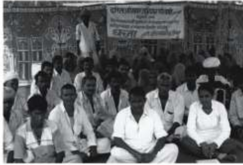
Collective protests demanding clean drinking water and work under drought relief

In addition, we recognised the need for intensifying efforts at capacity building and identifying alternate platforms and means of administering training. During the year, we developed and implemented training modules covering women's rights and legal provisions, self help groups, dalit atrocities, girl child education and healthcare. Such structured training modules were administered at the