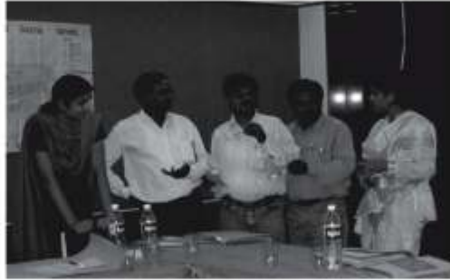
Capacity building for the Presidents and Chief Officers in Gujarat: participatory exercises illustrate the bases of decision making, facilitates governance reform and promotes civic engagement

In Idar, Prantij and Modasa towns of Sabarkantha district in Gujarat, we have conducted a study on economic activity in informal settlements of the towns and status of land entitlement. The results are being used to lobby to ensure land entitlement for the poor.