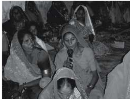
Women raising their issues and concerns at a capacity building programme under the Panchayati Raj Jagrukta Abhiyaan

We also facilitated Reflection Workshops for the Social Justice Committees in Sabarkantha and Ahmedabad districts. The workshop helped review the activities of the Committee and outline the future course of action. Based on the workshop, the Committees identified their inability in dealing with cases of atrocities and the urgent need to focus on NREGS related issues and work towards improving the quality of service delivery.