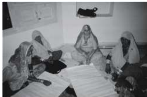
Promoting participatory planning and budgeting at the Gram Panchayat level

In Rajasthan, we conducted four rounds of trainings for the elected representatives, particularly for women. In recognition of the need for strengthening the relationship between women and land- as the primary source of livelihood, we conducted a two day training programme on land and revenue related issues in all nine blocks of Jodhpur district. We also conducted one day training programmes at the Block and Gram Panchayat level on the constitution, authorities and functioning of the Standing Committees. A two day training programme for all elected representatives in the district was conducted covering micro level planning, proper utilization of the budget provisions under drought relief and on the state supported schemes for rural development.