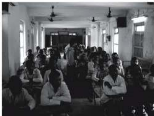
Furthering citizen education to promote democratic values in the rural areas of Gujarat.

In Gujarat, we trained 240 citizen leaders, including 50 women, from 40 Gram Panchayats in eight talukas of Ahmedabad and Sabarkantha districts on provisions of the Right to Information Act, National Rural Employment Guarantee Scheme and their role in furthering citizen education on democratic values.