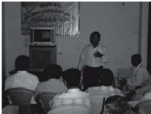
A trained official facilitating capacity building through the SATCOM initiative in Gujarat

In Gujarat, we have been involved with the training of select