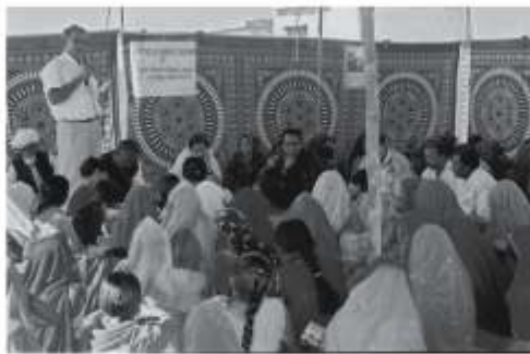
Promoting women's participation in the public domain: Mahila Gram Sabha at Hopardi

al policies with three partner organisations. Such an audit helps identify the extent of implementation, the grievance redressal mechanisms and create sensitivity towards gender concerns. In addition, UNNATI has been working to promote the practice of Gender Responsive Budgeting. During the year, UNNATI facilitated a workshop for sharing of initiatives and experiences with civil society organisations and government officials on Gender Responsive Budgeting. Presentations on current practices and specific initiatives in Gujarat were shared and there was extensive discussion on the need for promoting Gender Responsive Budgeting and issues, therein. We recognise the need for capacity building of civil society organisations and functionaries of various government departments. We have also built linkages with a large number of regional, national and international networks working on gender related issues to promote their mainstreaming.