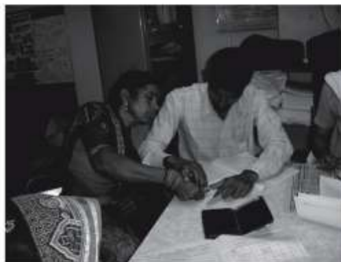
Extending support to women candidates during elections

During the year, we undertook a Pre-Election Voters' Awareness Campaign in 203 panchayats of six talukas in five districts of Gujarat. A state level consultation was organised in which more than twenty civil society organisations took part. As part of the initiative, we were involved in the preparation and dissemination of educational material relating to the processes and agency involvement in the election process. In addition, we also extended support to dalit and tribal candidates, especially women.